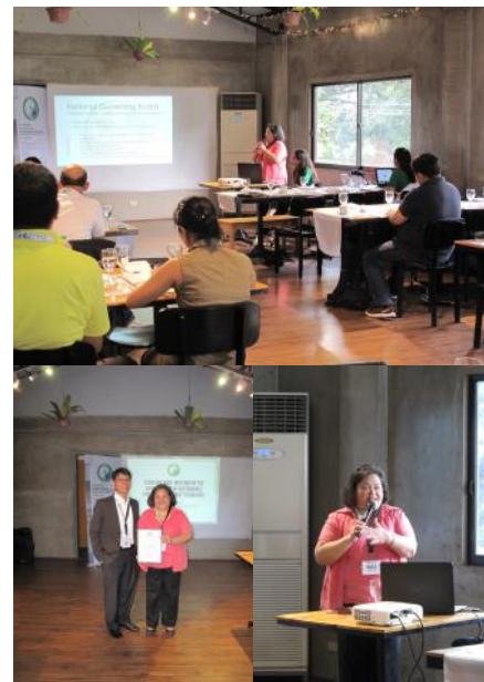
SFM Stakeholders Consultation, November 28, 2019,