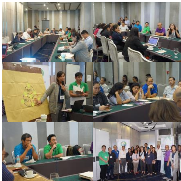
Capacity Building, June 5, 2019