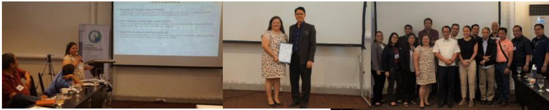
Capacity Building, May 24, 2019