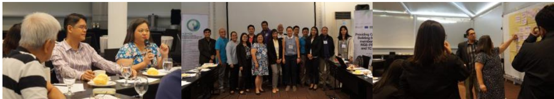
Capacity Building, May 22-23, 2019